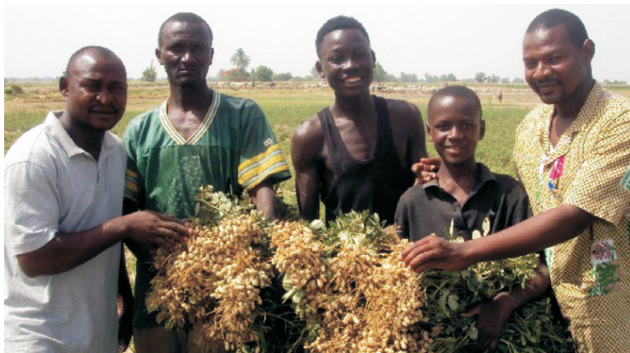
Figure 3. Dry season harvest SAMNUT 24, Minjibir Kano.