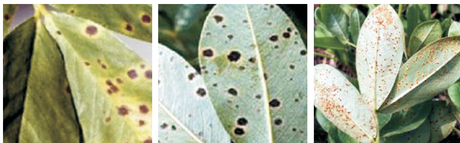
Figure 7. Symptoms of foliar diseases (ELS, LLS and Rust).