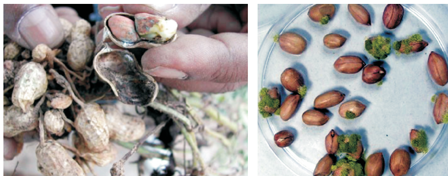
Figure 8. Aflatoxin contamination in groundnut.