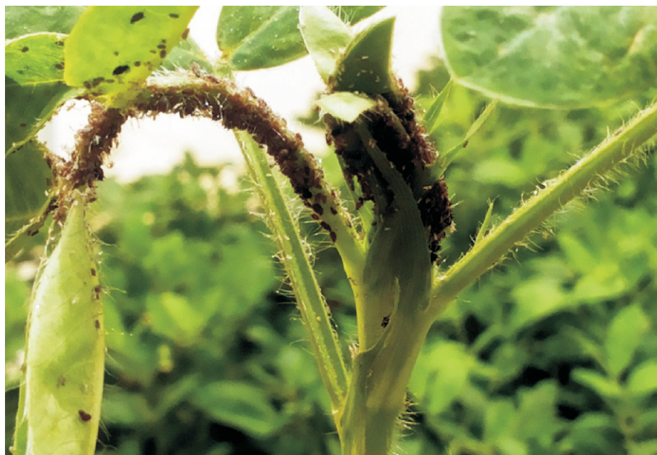
Figure 9. Groundnut aphid incidence.

These are brownish-gray polyphagous (that feed on other plants) insects. They are vectors of groundnut rosette disease, peanut mottle virus and peanut stripe virus in Asia and Africa. Aphids can cause yield losses up to 40% in groundnut. They can cause serious damage in drought situations when the crop is still young. Aphids are sporadic (periodic) pests and attack crops at all stages. Both adults and nymphs feed mostly on growing tips and young foliage by sucking sap.