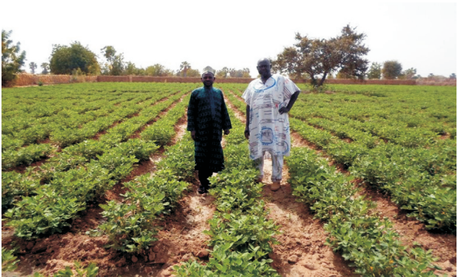
Figure 1. A dry season farmer in Safana LGA Katsina State.

Poor soil fertility: The soils of the dry savannas where groundnut cultivation is most popular are generally sandy, poor both in terms of nutrient content and water-holding capacity, and prone to erosion by wind and water. Any situation that precludes careful soil management can therefore easily lead to soil degradation, particularly in the dry areas where droughts are frequent. With the increase in demand for agricultural products arising from the ever increasing human population, farmers are forced to crop the same piece of land year after year, without allowing for any fallow period that would