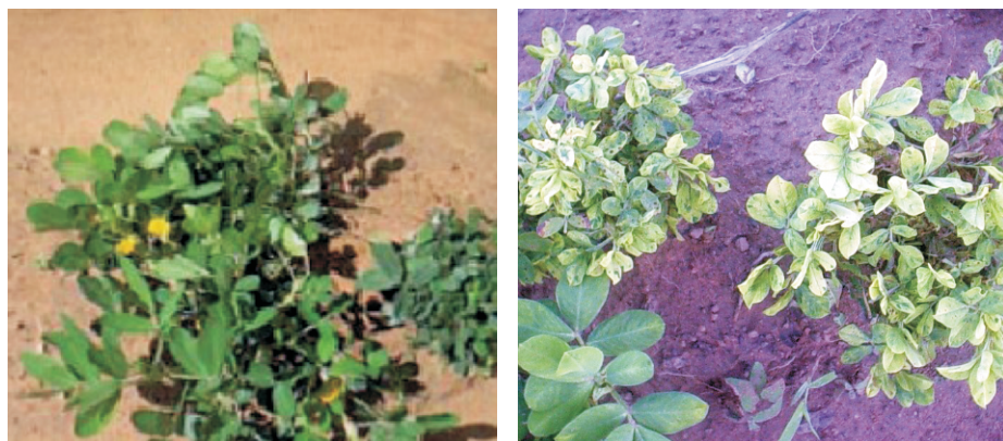
Figure 6. Groundnut green and chlorotic rosette disease.

A 100% loss in pod yield due to either chlorotic or green rosette disease may result if infection occurs before flowering. Control of aphids will prevent further spread of the disease.