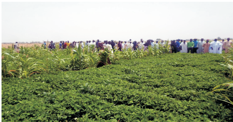
Figure 2. Farmers inspecting SAMNUT 22 in Warji Bauchi State.